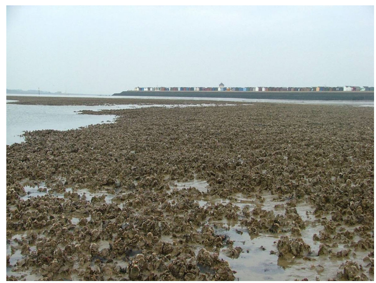
Fig. 2 Wild C. gigas reef that has established on intertidal mud on the Blackwater estuary at Brightlingsea (UK) in 2008