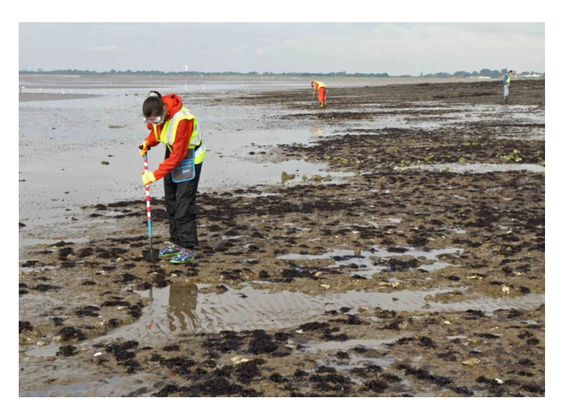
Fig. 4 Hand removal of C. gigas by volunteer workers on a protected chalk shore in Kent, south east England

Moreover, the density and spatial arrangement of Pacific oysters has been shown to affect the impact of wild settlement upon the native Australasian oyster Saccostrea glomerata (Wilkie et al. 2013). Although fishing activity creates different impacts and disturbances on intertidal benthic species and habitats (Hall and Harding 1997; Spencer et al. 1998; Kaiser et al. 2001; Piersma et al. 2001) and hand-collecting may disturb bird feeding at low tide (Goss-Custard et al. 2006), it is possible that the extent and intensity of these activities could be managed by acquiring licences. In the Blackwater estuary on the south-east coast of England, large areas of C. gigas 'reef' have been hand-picked 'clean' of wild oysters to create areas for re-laying oyster seed (Herbert et al. 2012). This seed does not grow to maturity to form reef but is either hand-collected or dredged and re-laid in creeks for ongrowing. A variety of wading birds can feed in areas where oysters have been removed and amongst newly laid seed.