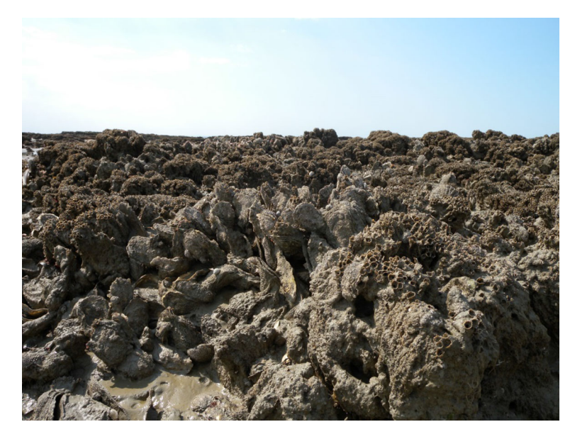
Fig. 3 Wild settlement of C. gigas on reef of Sabellaria alveolta . Bay of Mont-Saint Michel (France)

with high settlement of wild C. gigas (Markert et al. 2010), yet increasingly unsuitable habitat chemistry and anoxia associated with high rates of decomposition of biodeposits and microbial respiration is likely to be responsible for the suppression of species diversity at very high levels of C. gigas cover (Green et al. 2012; Green and Crowe 2013, 2014). Due to a sediment-free upper part of the reef and more turbulent current flow, species richness was significantly greater amongst the oyster beds compared to mussels and some faunal species were exclusively found on oyster beds, particularly anemones and suspension feeders (Markert et al. 2010). Higher species survival amongst the more complex oyster reef structure and bio-deposition of sediments was also thought to explain differences in species richness (Kochmann et al. 2008).