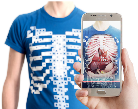
Figure 5 Curiscope T-shirt with visualisation of animated internal organs.

Available online: http://www.asvide.com/articles/1271