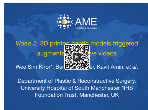
Figure 6 3D printed haptic models triggered augmented operative videos (34).

the simulated environments still fall short graphically from augmented images. According to the Lancet Commission on Global Surgery, 5 billion people do not have access to safe affordable surgery (30). Live operations using AR, have been broadcast to a global community with feasibility demonstrated for basic procedures both in Paraguay and Brazil (31). Virtual interactive presence and augmented reality (VIPAR) has developed a support solution that would allow a remote surgeon to project their hands into the display of another surgeon wearing a headset (32). Proximie is another platform that aims to introduce AR technology to surgeons in the developing world that will allow them to visualise real-time or recorded operations being performed by experts in other parts of the world, allowing for a breadth of surgical experience to be disseminated. Both complex visual and verbal communication enable long-distance intra-operative guidance (33). It is possible to