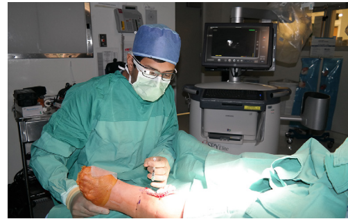
Figure 2 Use of Google Glass in theatre.