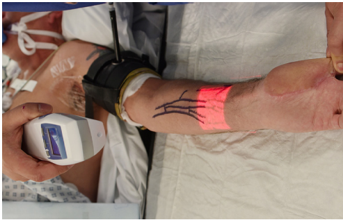
Figure 1 Use of Accuvein to image veins on patient.