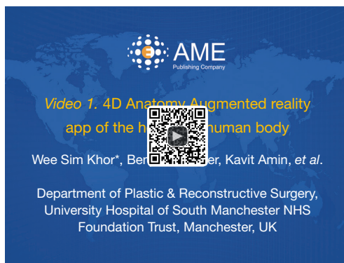
Figure 4 4D Anatomy Augmented reality app of the heart and human body (22).

Available online: http://www.asvide.com/articles/1271