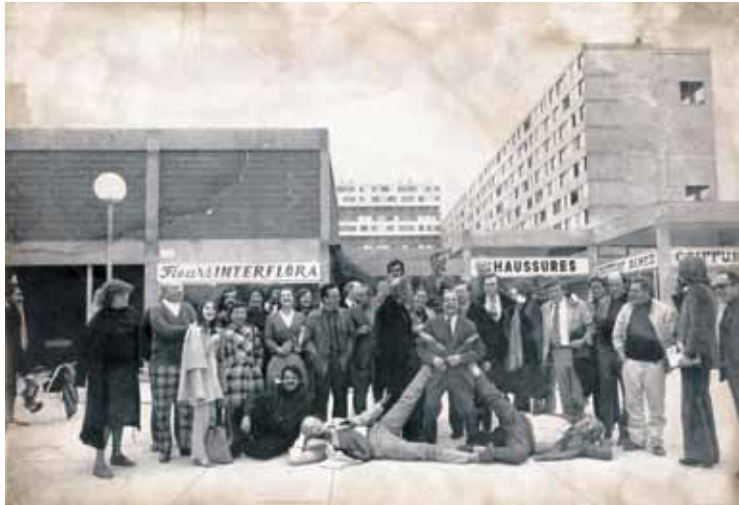
FIG. 5 TEAM 10 MEMBERS DURING A VISIT TO TOULOUSE-LE MIRAIL, 1971

in France to migrants from the countryside and from the former French colonies—work that was based on Candilis' earlier experience with the colonial administration in North Africa. 24 Yet another elaboration of the term can be found in the work of the Smithsons, who referred to the rise of a new “middle-class society” where the norms and aspirations of the prewar society were seemingly leveled out and the limits to former social mobility between the classes were removed. 25 The Smithsons also quoted the concept of the “Great Society” as used by Aneurin Bevan, the Minister for Health who initiated the National Health Service and was also involved in drawing up the new Town and Country Planning Act of 1947, which enabled the implementation of large-scale housing programs for the next decades, including the planning of New Towns. 26