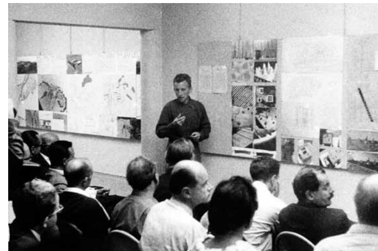
FIG. 1 OSKAR HANSEN DURING HIS PRESENTATION IN OTTERLO, 1959