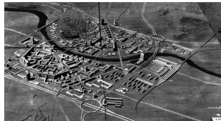
FIG. 3 JOHANNES VAN DEN BROEK AND JAAP BAKEMA, MASTERPLAN OF THE CITY OF SKOPJE, COMPETITION ENTRY, 1965