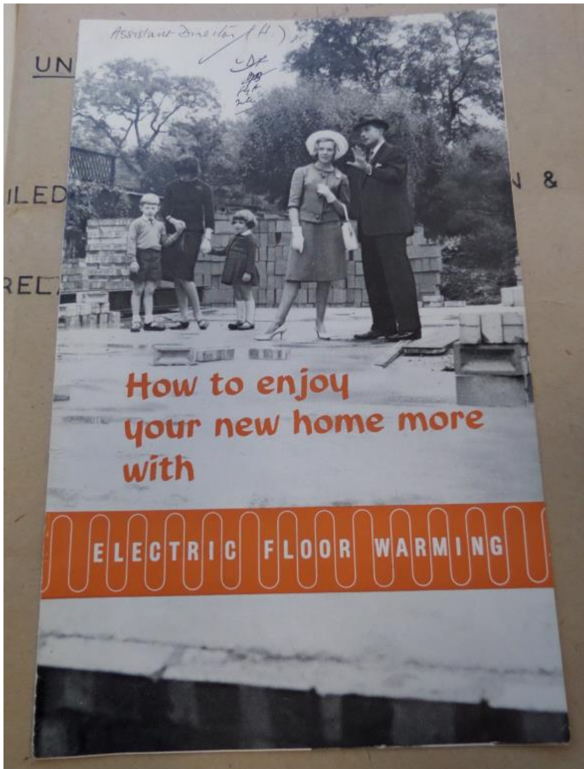
Figure 3. EDA Brochure promoting underfloor heating, with notes on the distribution of the leaflet within LCC in the top left corner, including to the Assistant Director of Housing. EDA leaflet 'How to enjoy your new home more with Electric Floor Warming', GLC/HG/HHM/10/L247 Part 1, Under floor heating, LMA.