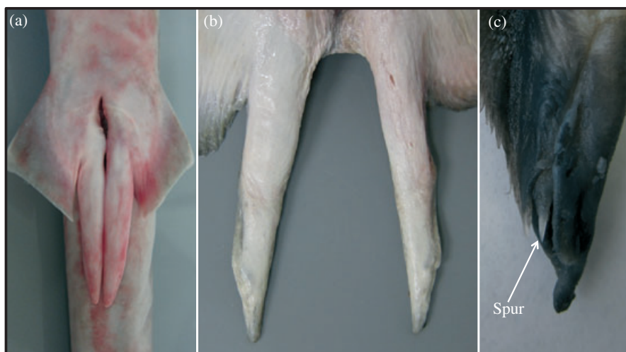
FIG. 3. Variation in clasper morphology in elasmobranchs: (a) Mustelus stevensi and (b) Neotrygon kuhlii . For clarity, the tail has been removed in the pictures. (c) The clasper of Etmopterus baxteri showing the clasper spur.

(Leigh-Sharpe, 1920, 1921, 1922a, b, c, 1924a, b, 1926a, b, c, d), and a review of the literature over the last 30 years uncovered clasper length data for an additional 70 species. Despite the abundance of data available and the known role of sexual selection in shaping genital morphology in other taxa, no study to date has attempted to assess whether clasper morphology is influenced by sexual selection and mating strategy. Several possible directions for future research on this topic in elasmobranchs are therefore presented here.