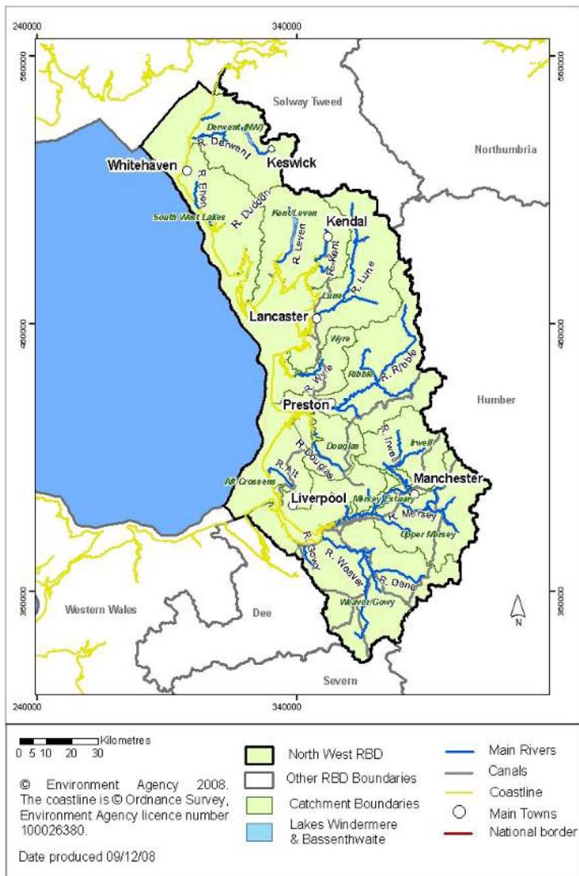
Figure 3: The Northwest River Basin District