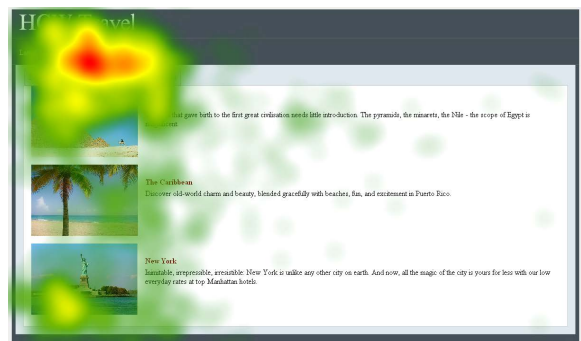
Figure 2: Heat Map of an Example Web Page.

In order to properly compare the scanpaths, their similarities and