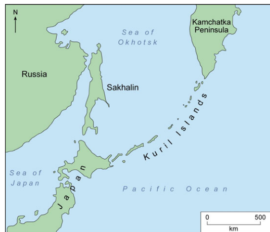
Figure 1 Sakhalin and the Kuril Islands

Much of the post-war history of these islands has been characterised by Japan and the Soviet Union/Russia tirelessly asserting their arguments by invoking geography, prior discovery and development, as well as international law and treaties in order to justify their claims (see, for example, Call 1992; Hasegawa 1998; Kuhrt 2007; Stephan 1974). The closest the Soviet and