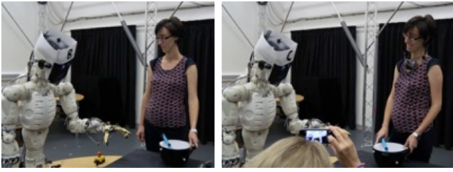
Figure 3: The contrast in a participant's reaction to the dropped egg in conditions B (left) and C (right).

to mirror the robot's expression. In interview, its effect was also remarked upon. For example: "You couldn't help feeling sympathy when it dropped the egg. You see the face and just go 'awww!'"