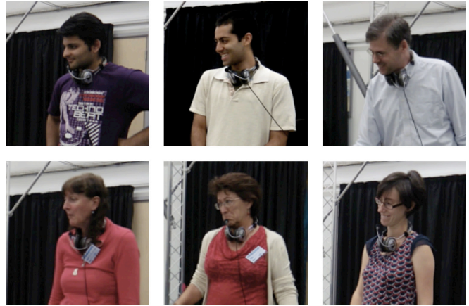
Figure 4: Reactions to BERT C's apology and regretful expression.

Participants reported that the time the task took with BERT C seemed shorter, even though it was actually approximately two minutes longer than with the other robots. In interview, three of the participants said that they thought A "seemed slower" or "quite slow," compared to C or even B. However, some did accurately judge the longer length of the task with C. One subject who chose A as his preferred candidate said he would have chosen C, but it was "too slow." Another was under the impression that, compared to A, B "was faster, more responsive and did improvise." In fact, the interactions with A and B were approximately the same length, despite B dropping an egg.