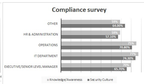
Fig. 2. Information security compliance results

The survey findings indicate that there is a high sense of security awareness but secure practice and behaviour is low, which can have a significant impact on compliance. Although, not surprising, there seem to be higher evidence of compliance by employees in the IT department more than any other respondents. Considering that this survey is administered on employees from compliant certified financial institutions, it supports our understanding that security by mere compliance is a wishful approach to information security issues in Nigerian banking institutions.