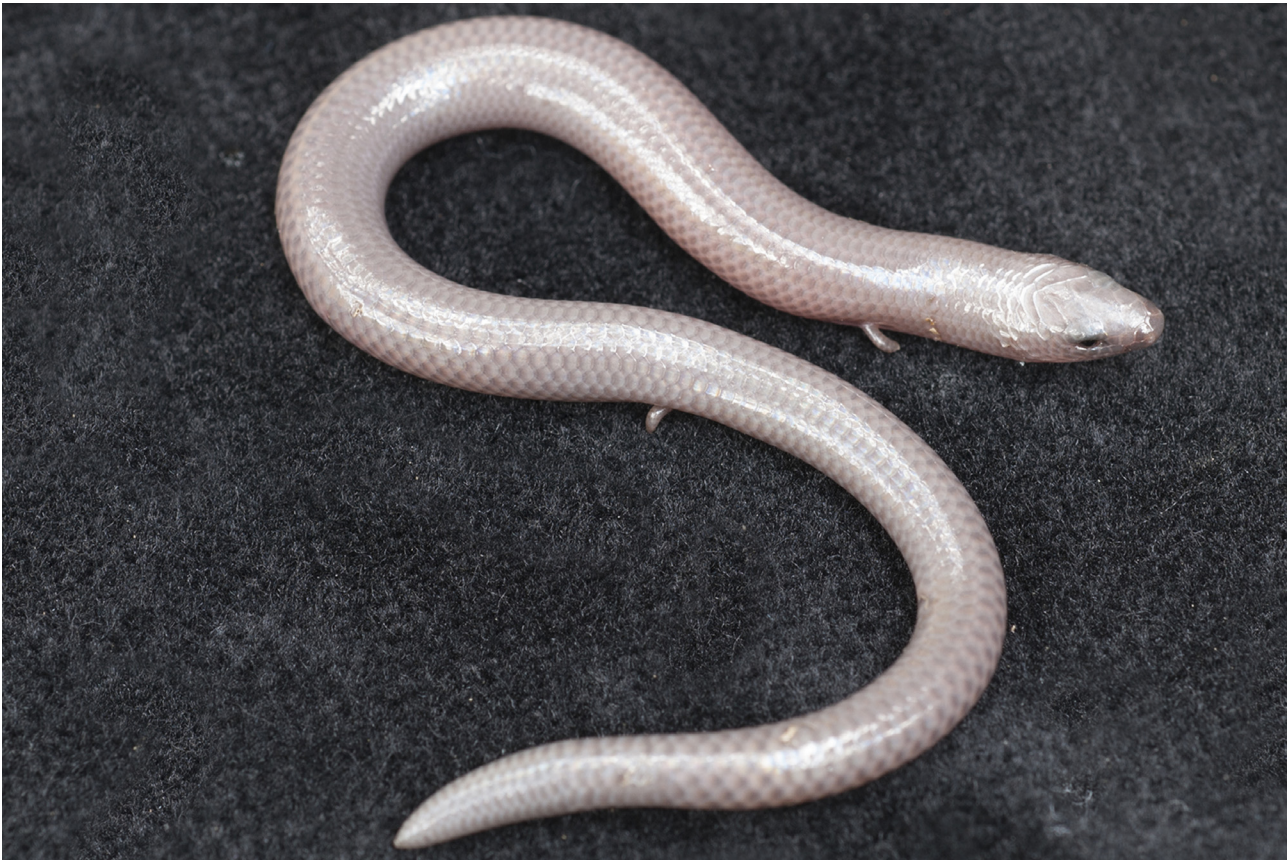
FIGURE 3. Photograph of holotype in life of Brachymeles ligtas sp. nov. (PNM 9818). Note: Individual is about to shed, resulting in lighter scale coloration.

by allied forces near the end of World War II, Onoda resisted surrender for 29 years believing the war was not yet over. Onoda would finally surrender in 1974, allowing the communities of Lubang to move on from the hardships faced during this time period, including the loss of over 30 lives and injuries to dozens more. Suggested common name: Lubang Slender Skink.