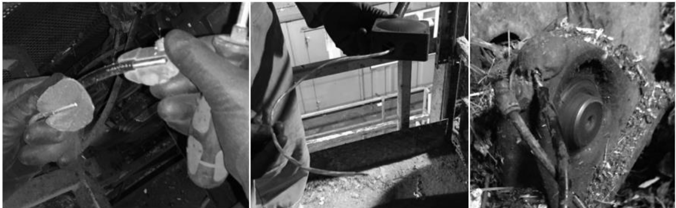
Figure 3 - Examples of RTD sensor issues encountered (l-r) sensor detachment, cable severing and sensor head damage

In addition to technical issues associated with the trial implementation cultural issues were also observed. Due to the technical issues encountered users were unable to develop confidence in the system thus limiting its utilisation within the Plant. Additionally, whilst trying to enact the significant operational change associated with the introduction of the system, regular operation was both continued and prioritised, for obvious reasons. Therefore, it proved difficult to obtain the personnel resources required to both maintain and support the introduction of the system on a continual basis. As identified in Section 4.3.4, personnel at the Plant are already fully utilised and thus no on site resource could be dedicated by the operator to ensure success of the system.