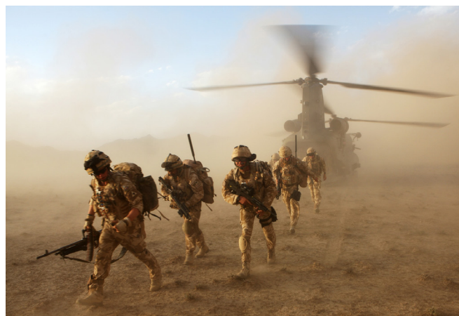
UK anti-drug operation in Afghanistan, 2009

So, as the two conventions clearly articulate, there are in reality two distinct drug wars being fought, in parallel. The first is the fight against addiction, which criminalises those who use, supply or produce certain drugs for non-medical purposes.