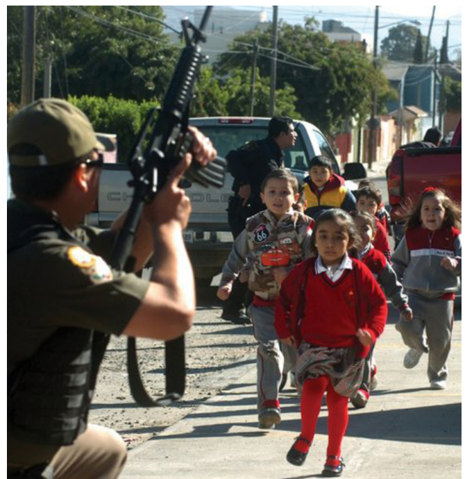
Schoolchildren fleeing drug-related violence in Tijuana, Mexico

Throughout Latin America, but also in Central Asia and West Africa, long-running civil wars and decades of poor governance have been exacerbated by the war on drugs. An estimated 95% of illicit drug production occurs in such areas, and trafficking from and across them is made easier by their chaotic environment. 22