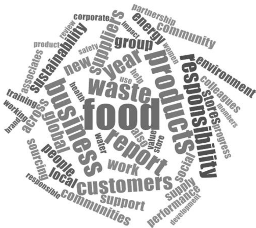
Figure 3: Word Cloud – Top 6 UK Supermarkets' CSR Reports