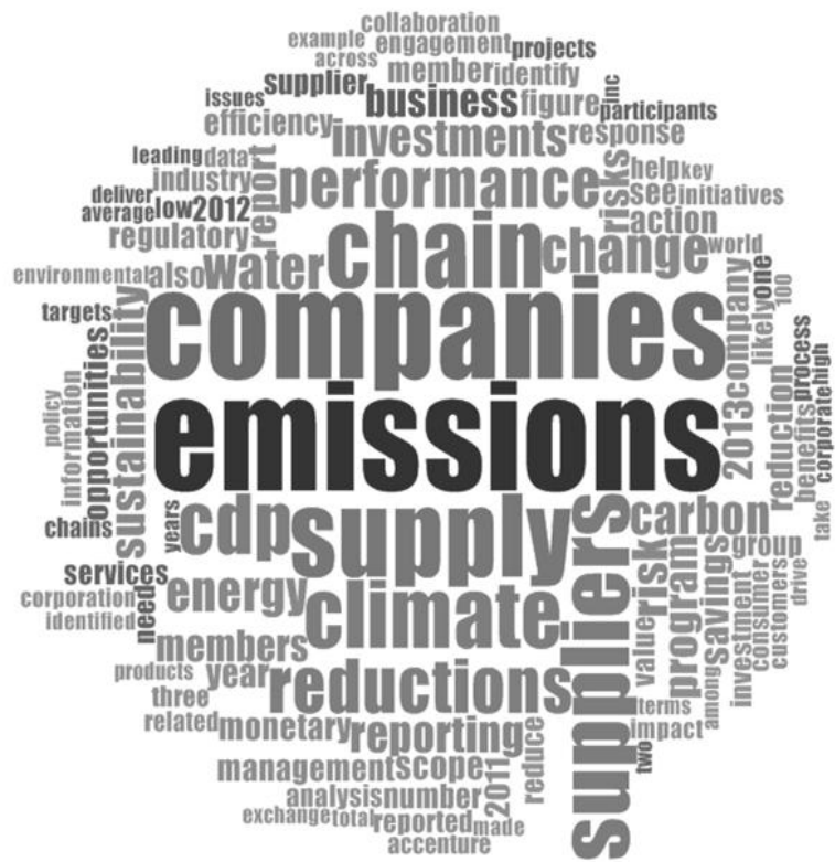
Figure 2: Word Cloud for CDP Supply Chain report 2014