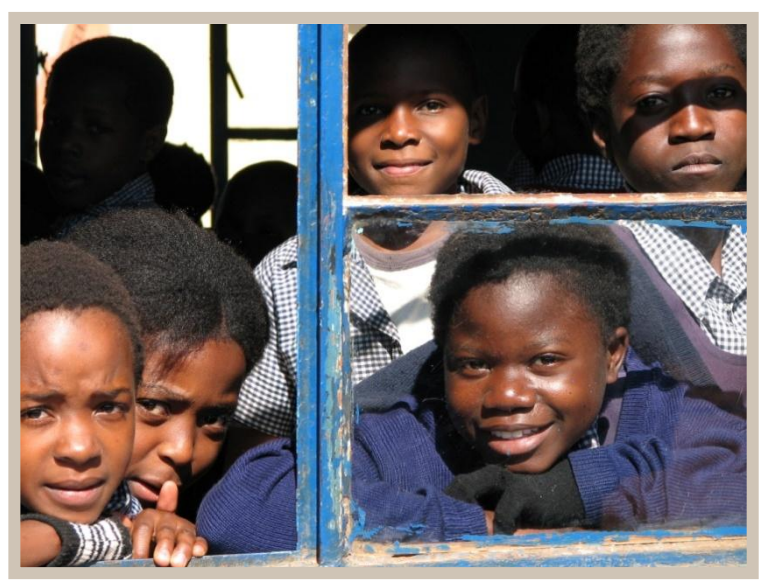
Girls at Zambian basic school