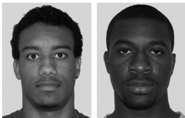
Fig. 1. Examples of variation in stereotypicality of Black faces. These images are the faces of people with no criminal history and are shown here for illustrative purposes only. The face on the right would be considered more stereotypically Black than the face on the left.

phia, Pennsylvania, that advanced to penalty phase between 1979 and 1999. Forty-four of these cases involved Black male defendants who were convicted of murdering White victims. We obtained the photographs of these Black defendants and presented all 44 of them (in a slide-show format) to naive raters who did not know that the photographs depicted convicted murderers. Raters were asked to rate the stereotypicality of each Black defendant's appearance and were told they could use any number of features (e.g., lips, nose, hair texture, skin tone) to arrive at their judgments (Fig. 1).