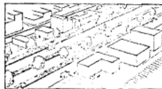
PRIMARY ARTERY IN BUSINESS AND INDUSTRIAL AREA

The former through-street becomes a local street severing the shopping center. A service street with off-street parking at the rear of shopping center is completely separated from the artery by a buffer strip. Another buffer strip protects the rear of residential properties which face on another street.