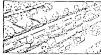
PRIMARY ARTERY PASSING THRU RESIDENTIAL AREA

Showing separation of the artery from adjacent residential property by means of buffer strips. Residents have access to local streets only.