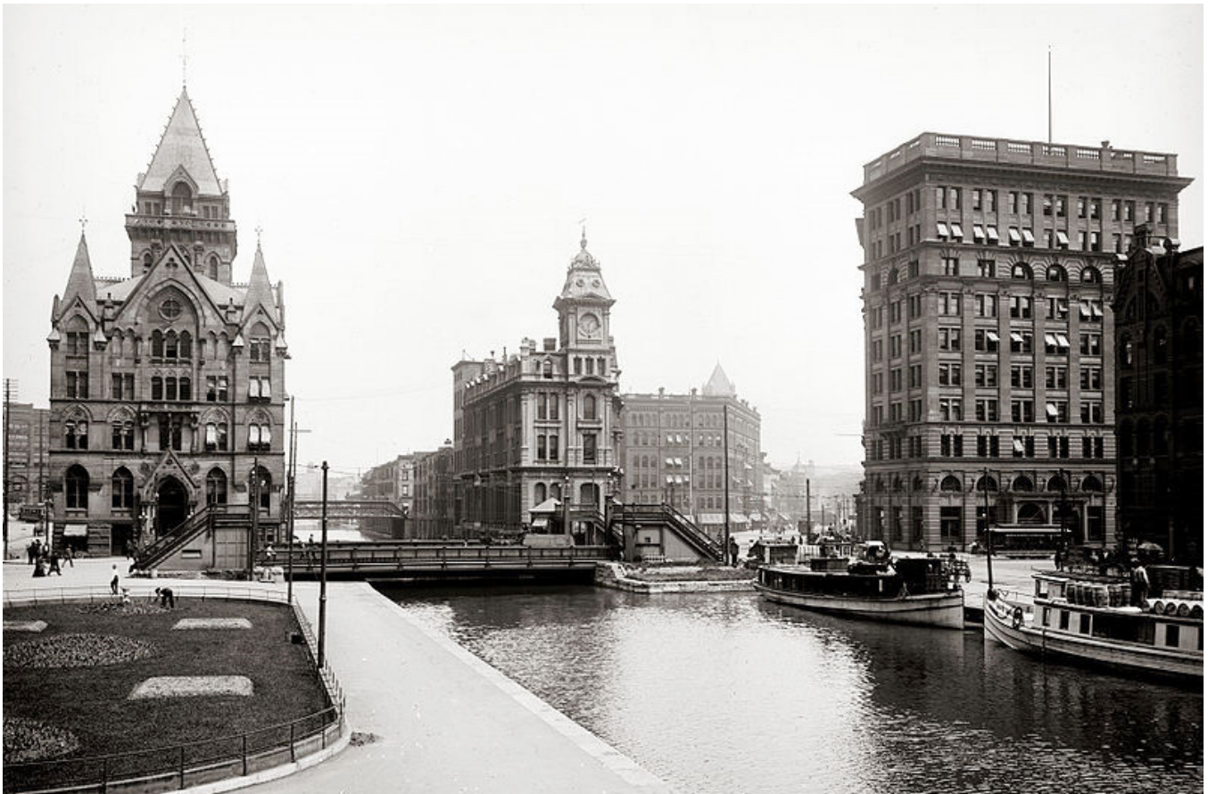
Figure 1: The Erie Canal at Salina Street, circa. 1900 (Library of Congress) Now the site of Clinton Square, once speculated to be the perfect site for a surface parking lot to serve local businesses. Source: Library of Congress

of registered vehicles jumped to 88,400. 6 In the 1940s, transportation planning in Syracuse was an unlikely mix of local progressive interest and private sponsorship. In 1940, Fortune Magazine nominated Syracuse as a “model mid-size city” and provided the framework and funding for Syracuse’s first transportation plan. This plan, which was published in the Syracuse Post War Traffic Report (SPWTR), outlined the development of two major transportation arteries: an east-west artery following the old Erie Canal, now called NY Highway 5, and a north-south artery following NY Highway 11. These two roads converged in downtown Syracuse as Erie Boulevard and Salina Street. This plan also included a beltway and proposed exchanges to integrate the downtown portions of the streets to through-highways and Interstate 90. 7 The SPWTR sought to alleviate congestion in downtown Syracuse, while improving the city’s connection to the trade routes it sat astride, allowing access to New