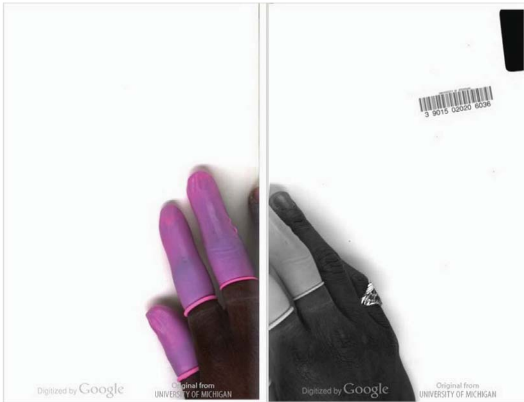
Fig. 1 Scanner's hand on end paper (Van Denburg 1895, p. 380)