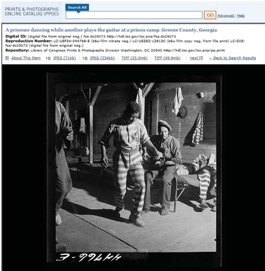
Fig. 3 Library of congress display of image download options (Delano 1941)

some insight. First, the provenance—or chain of custody—of any given manifestation of a digital surrogate encompasses all of the previous versions that were publically accessible. In the case of the FSA collection, the truthfulness and trustworthiness of the interpretations made from digital surrogates turn on two factors: first, being able to see the version that was used to make the initial interpretation; and second, knowing the visual evidence revealed through re-digitalization and contemporary image file manipulation. Bigger files may not necessarily be better files if delivering the new comes at the expense of undermining interpretations of previous versions. The simplest but most costly solution is to keep multiple versions, document the technical processes that produced the new version, and track the changes from one version to the next. For example, the PREMIS 2.0 metadata standard is capable of capturing and organizing documentation on change events, but mechanisms for exposing PREMIS data to the end user must be fully developed (Caplan 2009). This type of provenance documentation helps endow the surrogate collection distinctive archival properties.