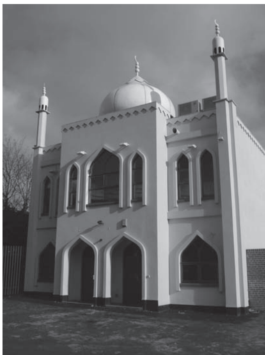
Mosque in Bristol, where 1001 years of ethnicity and identity are being studied.