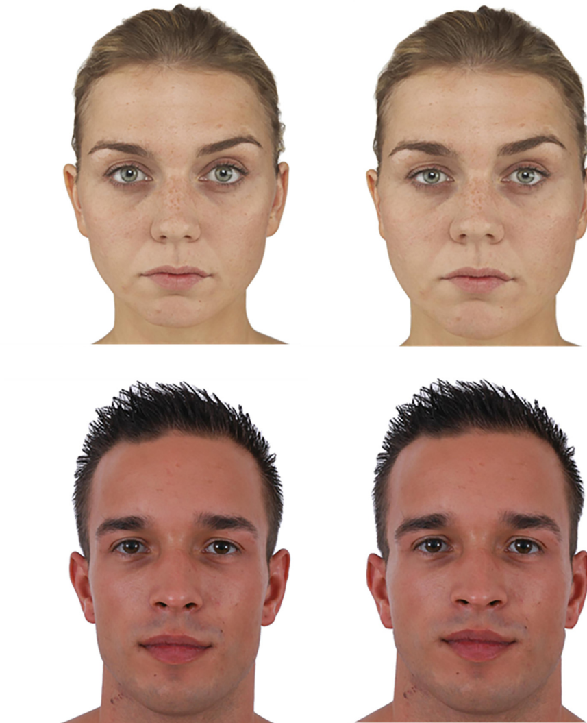
Fig 1. Original (left) and “heavy” (right) versions of test faces.