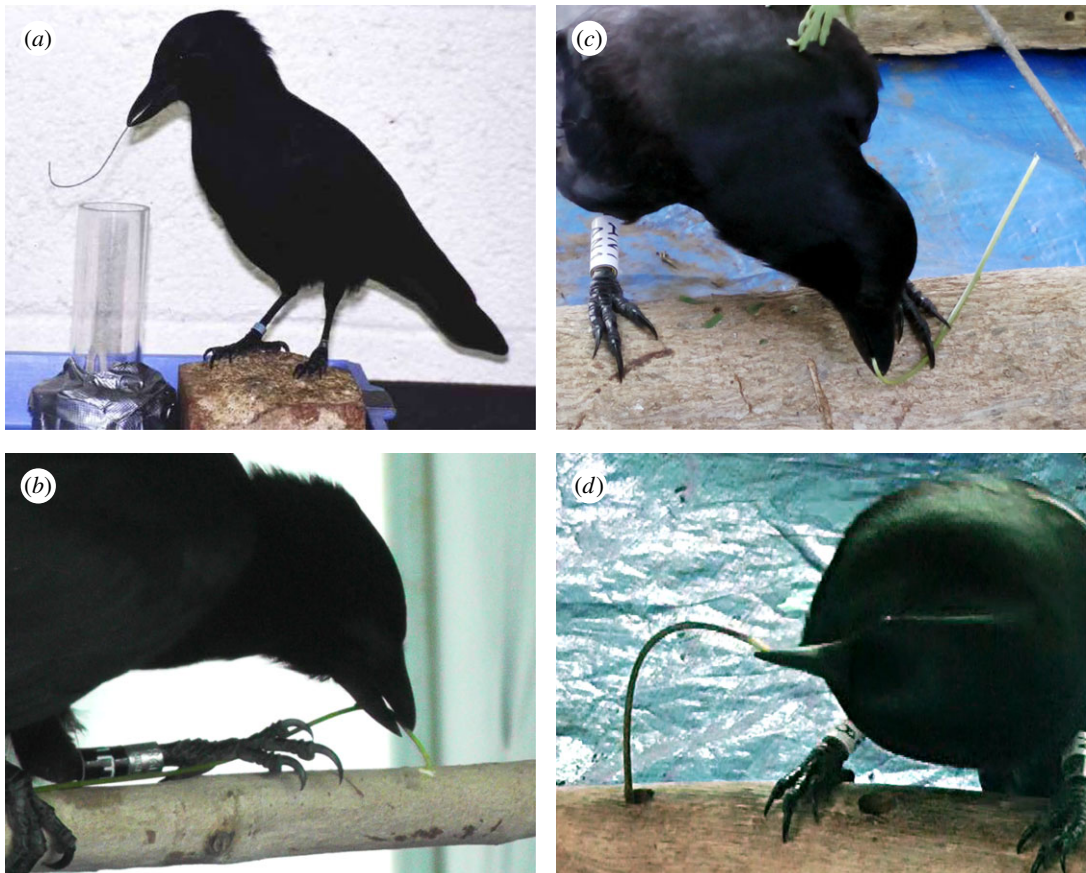
Figure 1. Tool-bending behaviour in New Caledonian crows. (a) ‘Betty’ about to use a bent piece of garden wire to lift a baited container from a vertical tube (from [1]; reproduced with permission from AAAS). (b–d) Temporarily captive crows using a range of techniques for bending the shaft of hooked stick tools during natural tool manufacture (from [4,7]).