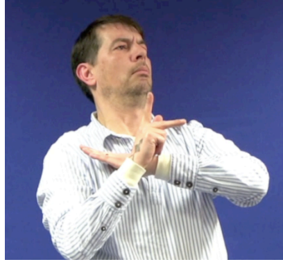
Figure 2. The blind man walking with his cane in Paul Scott's Tree