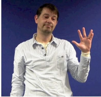
Figure 8. Fingers close together in 'illegal' handshape symbolising the close relationship of the senses of hearing and sight in the Deaf person