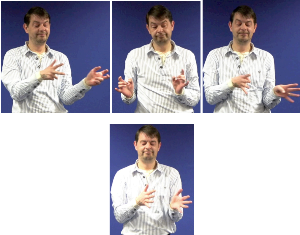
Figure 10. Playing with a ball, first three frames using handshapes inappropriate for a ball (clawed V, IL and 4), final frame using correct handshape for handling a ball