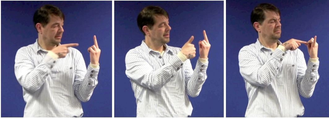
Figure 5. Fully-scaled referent shown through person transfer (close-up shot) interacting with referents shown through situation transfer (distance shot)