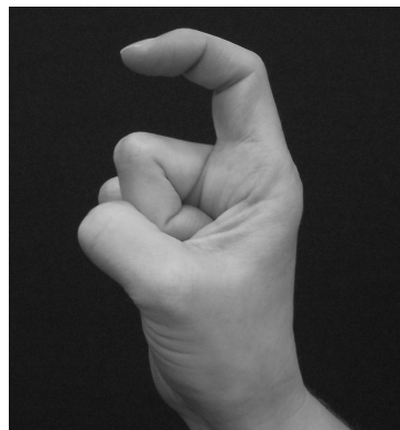
X (= curved 1)