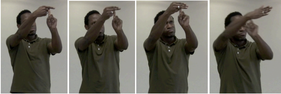
Figure 3. Increasing number of fingers showing the closer – and larger - flag in David