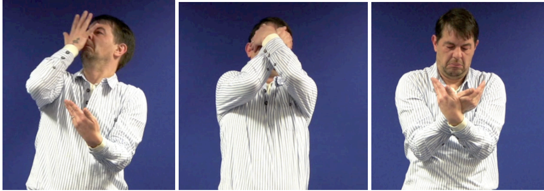
Figure 9. The sign SHAME, transferred metaphorically to give shame a concrete visual form as bird wings, covering the face, then as something that can be looked at