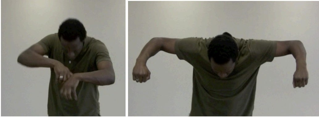
Figure 7. First frame, fingers bent and head bent to show bent heads of all the horsemen using distance and close-up shots

Second frame, fists and head bent showing medium distance and close-up shots