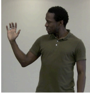
Figure 6. Lead horsemen nods (person transfer nods the head to shows nodding) and some of his band nod (situation transfer bends the fingers to show nodding) in agreement.