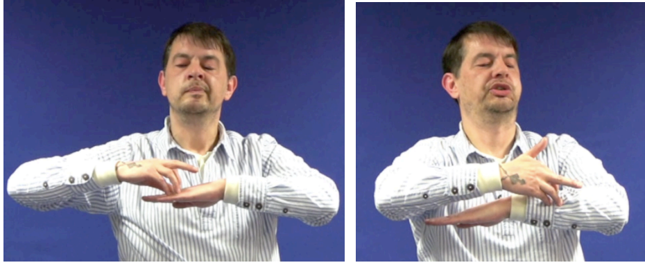
Figure 1. The dog in Paul Scott's Tree , walking and cocking its leg