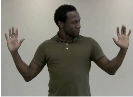
Figure 4. Lead horseman (shown on head and body) in a line with other horsemen (shown by individual fingers)