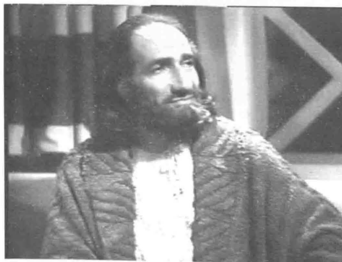
Figure 3: A more Semitic Saint Paul in Quo Vadis is made subordinate to the obviously Gentile St. Peter.