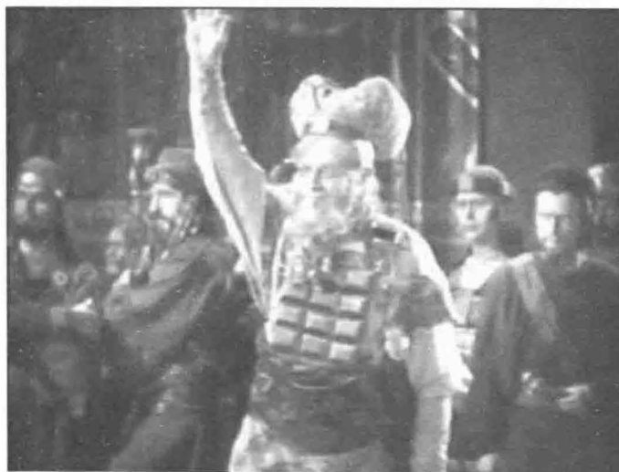
Figure 2: Caiaphas in The King of Kings (1927)

While the sadistic and godless soldiers mercilessly beat Christ and ridicule him with their Italic dialect, and the robed and head-dressed middle-easterners speak in a sister language to Arabic, one is tempted to wonder if another version of the Judeo-Christian is working its way onto the screen – Dennis Prager's Judeo-Christian America pitted against European secularism and Islamic fundamentalism 22 – and if it will prove as lasting and indelible as its predecessors.