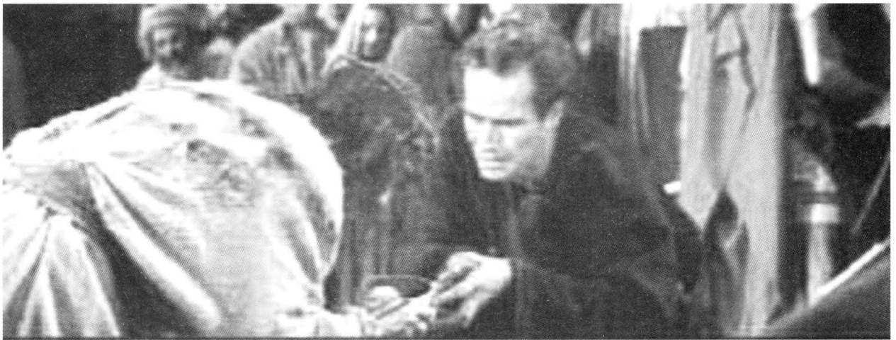
Figure 1: Charlton Heston, Cecil B. DeMille's favorite actor for Biblical epics.