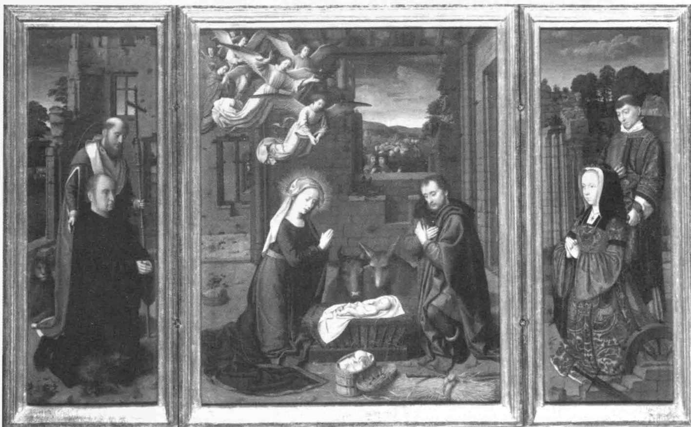
Figure 1: Gerard David, "The Nativity with Donors and Saints Jerome and Leonard." The Metropolitan Museum of Art, The Jules Bache Collection, 1949. (49.7.20 a-c)

Metropolitan Museum of Art. www.metmuseum.org/explore Gerard David. Nativity