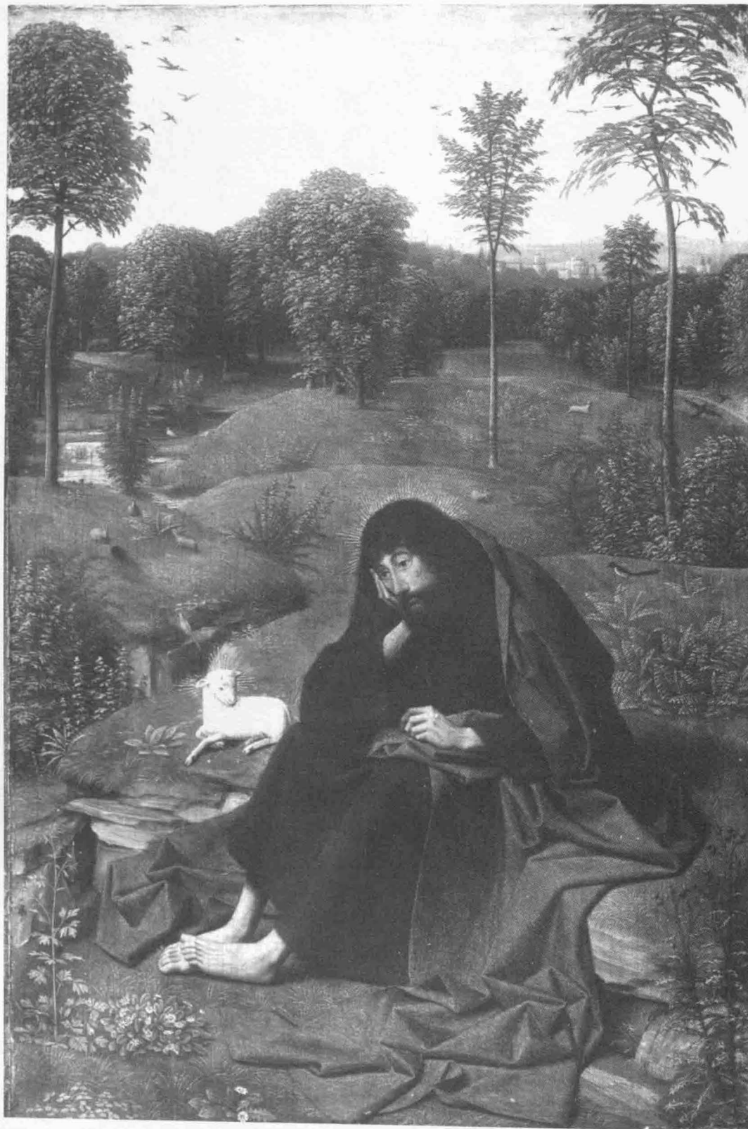
Figure 4: Geertgen . "John the Baptist in the Wilderness." Staatliche Museen zu Berlin. Preussischer Kulturbesitz Gemaldegalerie.