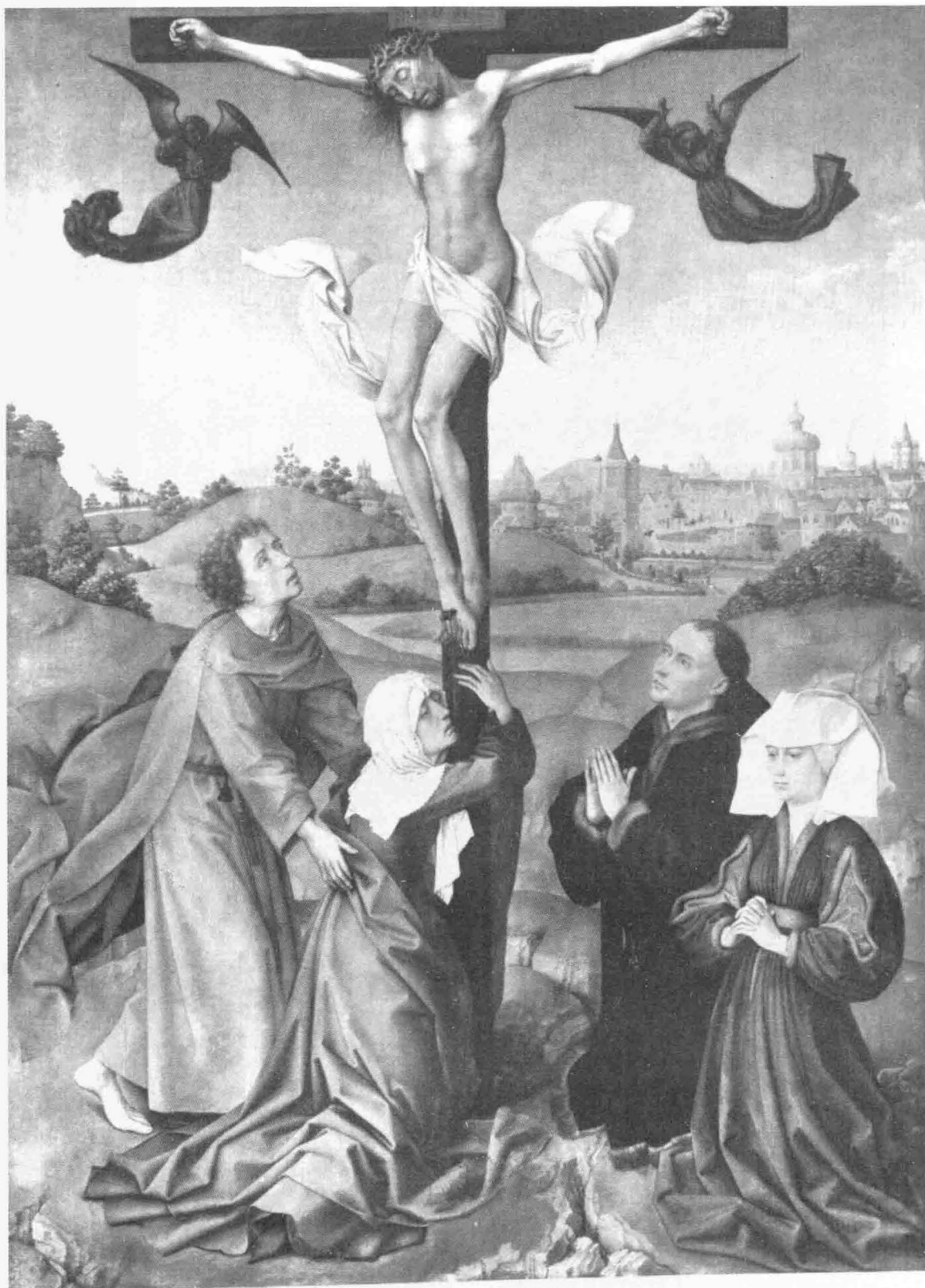
Figure 3: Roger van der Weyden, "Crucifixion." Vienna, Kunsthistorisches Museum