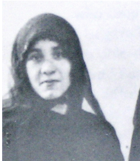
Agnes as a novice of the Sisters of Loreto (Sebba 1998)

twenty years at St. Mary's as a teacher and as a principal before receiving her "inspiration" (Chawla 1992:7-8).