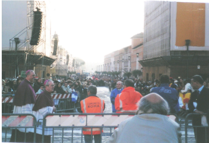
Cardinals walk past Via della Conciliazione , along a passage created through the crowd and guarded by Roman police (Author's photo).

the ceremony, the Church recognized the inherent ambivalence of Mother Teresa as “a person or thing put on display that evokes responses ranging from admiration through curiosity and contempt” (Manning 1992:291).