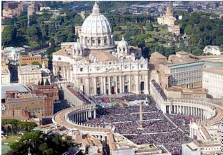
Piazza San Pietro, October 19, 2003.

The season was shifting and the Mediterranean winds were bringing in unpredictable weather. I had just returned from northern Italy, visiting the Veneto area, where it was already cold. Waking up early on Sunday morning I put on layers just in case the day turned out to be colder than anticipated. I was studying in Rome for the semester through the University of Arkansas' Rome Study Center. Early in the week, the Center had posted a bulletin of upcoming events in Rome. I knew the current Pope, John Paul II, was celebrating his 25 th year of service to the Roman Catholic Church but I didn't know that he was planning to beatify Mother Teresa. This event was posted as free and open to the public and I was excited for the opportunity to attend an event of such ecclesiastic significance.