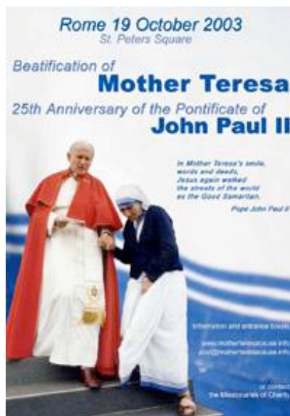
One of the official posters of the beatification ceremony (Missionaries of Charity 2003).

Mother Teresa as a Blessed has certainly not escaped the attention of the internet either. Her cause for canonization, an official process any beatified must be submitted to before being made a saint, is online at www.mothersacause.info . On this page one can view her biography and the Homily of His Holiness John Paul II spoken at the beatification ceremony, read and memorize her prayer for canonization in hopes of receiving a miracle, and see her favorite prayers and quotes. On the “links” page there is a site where posters commemorating the beatification ceremony are available for sale, much like a promotional posters of music artists or actresses.