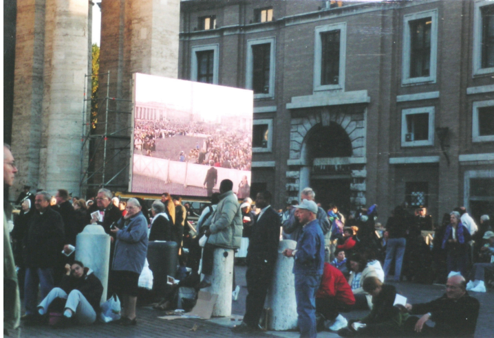
Audience members watch the ceremony and themselves on screen (Author's photo).

Since the Vatican II Council, the Church has realized and accepted the power of the media, very successfully incorporating it into its mode of communication to the secular and faithful worlds. The press office of the Vatican was established on April 18, 1961 (Heston 1967:26) to acknowledge the necessity of the official Vatican perspective on Church issues that can compete with secular news and popular opinion. Edward Heston writes, “It is no exaggeration that the contribution of the press to the Second Vatican Council was invaluable and even indispensable for the proper dissemination of news from the Council Hall. The world assuredly would not have maintained its consistently kept interest over such a protracted period of time had it not been kept carefully informed on a day-to-day basis” (1967:98). The emergence of the Vatican II ideals was a paradigm shift that reverberates decades later in the beatification ceremony of Mother Teresa. While not all of its ideals are followed (Pope John Paul II was unabashedly a conservative and a traditionalist) the importance of the press and the Church’s public (secular) image, as demonstrated by the press surrounding the Vatican II, has been consistently remembered.