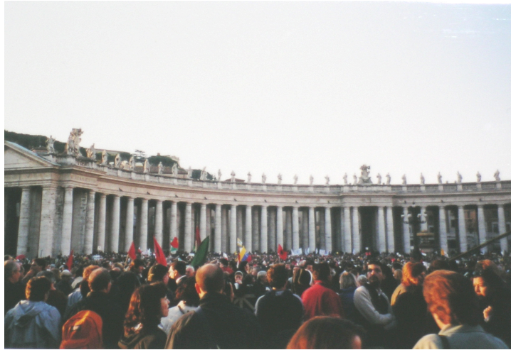
Flags of identity are waved across the piazza.

longer tightly territorialized, spatially bounded, historically unselfconscious, or culturally homogenous (Appadurai 1991:191).