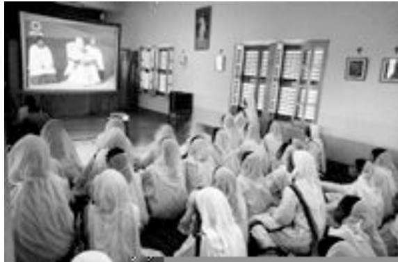
Nuns of Missionaries of Charity watch the ceremony in Calcutta (Mother Teresa's Beatification 2005)

procedures, rather like a prosthetic device, that permits intelligence to be used in certain ways, but not in others” (Bruner 1991:12).