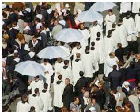
The procession of the Eucharist winds through the audience (Sisters of St. Paul 2003)

“If symbols, . . . are strategies for encompassing situations, then we need to give more attention to how people define situations and how they go about coming to terms with them” (Geertz 1973:141). As the speeches ended and I began to realize that what was happening in Latin and Italian was a Mass, I began to feel insecure about my motives for entering into this cultural performance. I had come because I appreciated Mother Teresa’s transnational acts of peace and goodwill. I appreciated her insistence on acknowledging and accepting the poor into the structure of humanity. I was not in St. Peter’s to go to church or affirm a spiritual identity. There was a period in my life when I did believe in the tenets of Christianity, but I do not (and did not then) believe in them. As the white umbrellas of the officials giving out the wafer representing the transformed flesh of Jesus moved closer to me I quickly reassessed my position in the ceremony as a tourist, a spectator, a non-believer, and an anthropology student. I looked around at those who eagerly waited for the umbrellas to close in on their position. As a non-Christian, and especially a non-Catholic, I was thrust into a decision of whether or not to participate in this ritual within the ceremony. I was suddenly faced with the possibility of being an outsider from the ceremony and the audience if I did not participate.