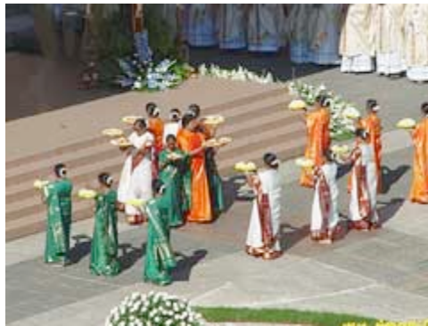
Indian women dance at the beatification ceremony (Sisters of St. Paul 2003).

The audience gathered for Mother Teresa and for the ceremony, made up of so many cultures, was not as novel or as unexpected as another feature of the ceremony. Soon another permeation of the East revealed itself in the rhythmic sounds of sitar music and Indian singing. The clear, harmonious picking of the sitar and delicate warble of the voices vibrated across the breadth of the piazza encircled by the white travertine statues of ancient (mostly European) saints. What I later learned to be translated hymns, were being sung in an Indian language while young Indian women in colorful orange, white, and green saris danced and offered incense to the altar established next to Pope John Paul II. The Church, within its own established boundaries, had encompassed some of the most powerful examples of Europe (and the West's) established Other (India) within a prominent ceremony exemplifying the faith and the reality of the Church.