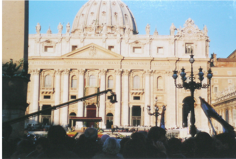
The boom camera pans around the audience.

The colors on these screens are vivid, the image of a speaker interrupted only to show the faces of the bishops, the other Missionaries of Charity, or a single weeping face in the crowd. Details of garb, shuffling of notes, a unique face, all are accessible to me through the screens. By the presence of the cameras I am simultaneously a viewer and a participant regardless of my personal choice. I look to the screens when I cannot see what is going on hundreds of feet in front of me, as is often the case. Others do the same, and many actually set up their chairs or move their bodies so that they are exclusively observing the screen, not the event as it is taking place before them, in so-called real-time. What has previously been a relatively direct ceremony becomes dramatized in the sweep of the camera, the close-up of a statue or the aerial view of the crowd. We watch ourselves just as much as we watch the ceremony.