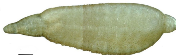
Figure 2. Cystobranchus klemmi taken from a creek chub, Semotilus atromaculatus from a spring flowing out of Big Spring Mill in Independence County, Arkansas. Scale bar = 1mm.