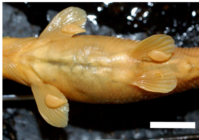
Figure 1. Cystobranchus klemmi on a highland stoneroller, Campostoma spadiceum , from the Saline River in Howard County, Arkansas. Scale bar = 1cm.