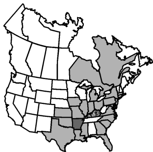
Figure 3. Arkansas collection site of Anasa armigera .

Arkansas Mississippi Connecticut Missouri D. C. North Carolina Delaware New Jersey Florida New York Georgia Ohio Iowa Oklahoma Illinois Pennsylvania Indiana South Carolina Kansas Texas Kentucky Virginia Louisiana Massachusetts + Ontario Maryland Quebec Michigan (Canada)