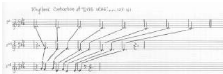
Figure 6. First Statement of the Dies Irae and the Manner in Which it is Rhythmically Contracted. Hector Berlioz. Fantastic Symphony: An Authoritative Score, Historical Background, Analysis, Views and Comments . Ed. Edward T. Cone. New York: W.W. Norton, 1971. pp. 155-156.

Here, Berlioz’s rhythmic treatment of the Dies Irae quote is interesting in the manner in which it is systematically “contracted” or diminished in meter. The intervals are what makes this quote hold together, as the rhythmic manipulation is somewhat difficult to hear. This contraction is further obscured by the fact that each of the diminutions occur on a weak beat, displacing the accents in both the meter and the “expected” accents of the Dies Irae quote. Each of the three main statements derived from the Gregorian chant is treated in this same rhythmic manner. Berlioz’s application of a version of the renowned