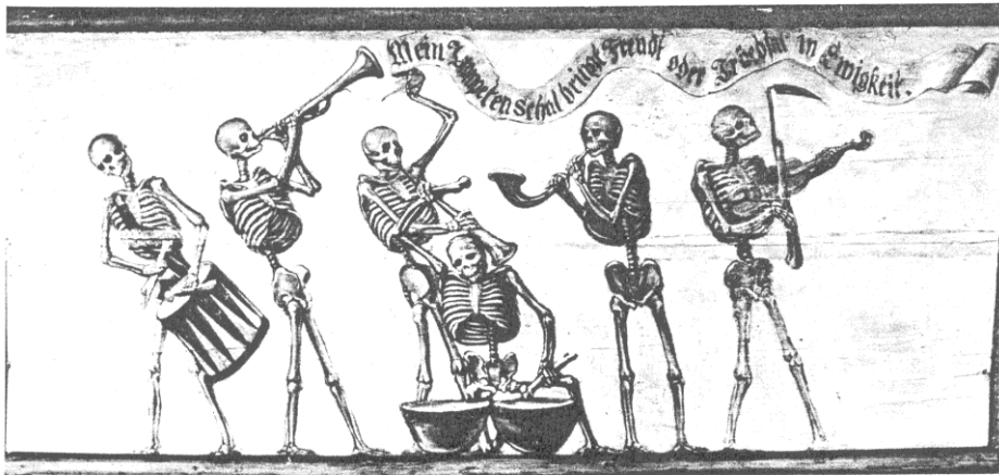
Figure 5. Reinhold Hammerstein. Ibid. Plate 231. “Bleibach, Beinhauskapelle, Totentanz, 1723: Todesmusikanten.”

Even in the earliest representations of the Totentanz , Death was often portrayed as playing a sort of straight-trumpet; Hammerstein suggests this is because of traditional Judgment Day iconography of the “trumpet sounding” to call souls to be judged. 4 However, Death was also often pictured playing “low”, dance instruments such as the kettledrum and various pipe and reed instruments (Figure 5).