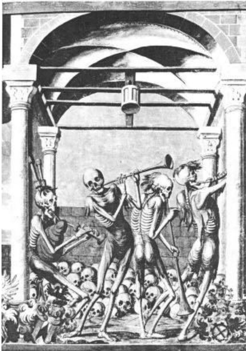
Figure 3. Reinhold Hammerstein. Ibid. Plate 179. "Bern, Dominikaner-Kirchhof, Totentanz des Niklaus Manuel, 1516/17-1519/20, zerstört, Aquarellkopie 1649; Beinhausmusik"