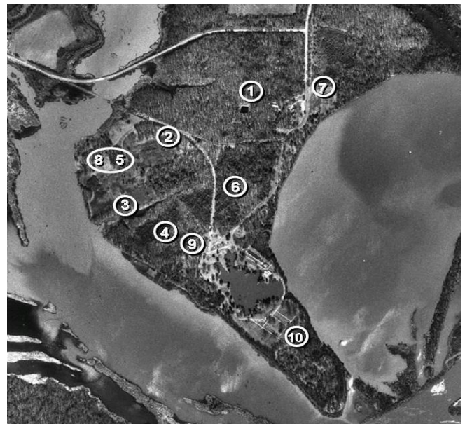
Figure 1. Location of numbered collecting sites at Arkansas Post National Memorial.

water oak ( Quercus nigra ), willow oak ( Q. phellos ), and cherrybark oak ( Q. pagoda ). Mixed oak stands additionally have winged elm and sweetgum. Sweetgum and mixed sweetgum stands are dominated by sweetgum, but also include some oaks. There were 3 small unique stands: eastern red cedar ( Juniperus virginiana ), loblolly pine ( Pinus taeda ), and black locust. The lone tall grass stand is dominated by Bahia grass ( Paspalum notatum ), blackberry ( Rubus sp. ), and goldenrod ( Solidago spp. ). All mowed areas are dominated by bermuda grass ( Cynodon dactylon ), and the mowed areas with trees have scattered post oak ( Q. stellata ) and pecan ( Carya illinoensis ). Details of the overstory, midstory, and understory vegetation on these sites can be obtained from General (2007).