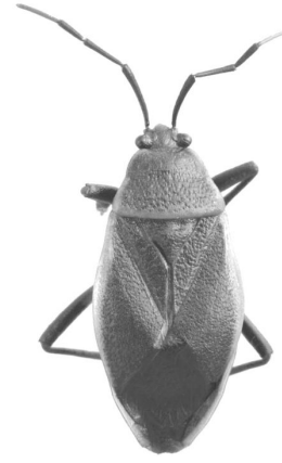
Figure 7. Dorsal view of Largus succinctus .