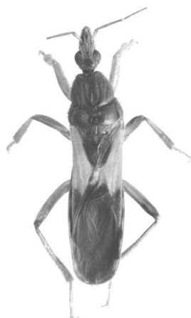
Figure 12. Dorsal view of Sirthenea stria carinata .