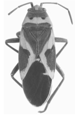
Figure 8. Dorsal view of Lygaeus kalmii angustomarginatus .