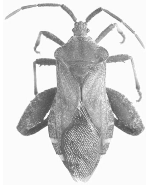
Figure 4. Dorsal view of Piezogaster calcarator .