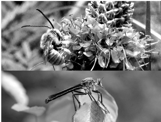
Figure 2. Images of males of Tetraloniella albata (top) and Microstylum morosum (bottom) taken at Terre Noire Natural Area (TNNA) during 2010.

The species was believed to be endemic to Texas (Martin 1960) until Beckemeyer and Charlton (2000) documented it in Kansas, Oklahoma, Arizona, New Mexico, and Colorado. More recently, M. morosum was documented at TNNA – about 320 km distant from the nearest eastern occurrence then known in Texas. This first documented Arkansas record was discovered on 19 July and a voucher specimen was collected 20 July (Warriner 2004). In Texas, the species has been collected between 28 June and 26 August (Bromley 1934).