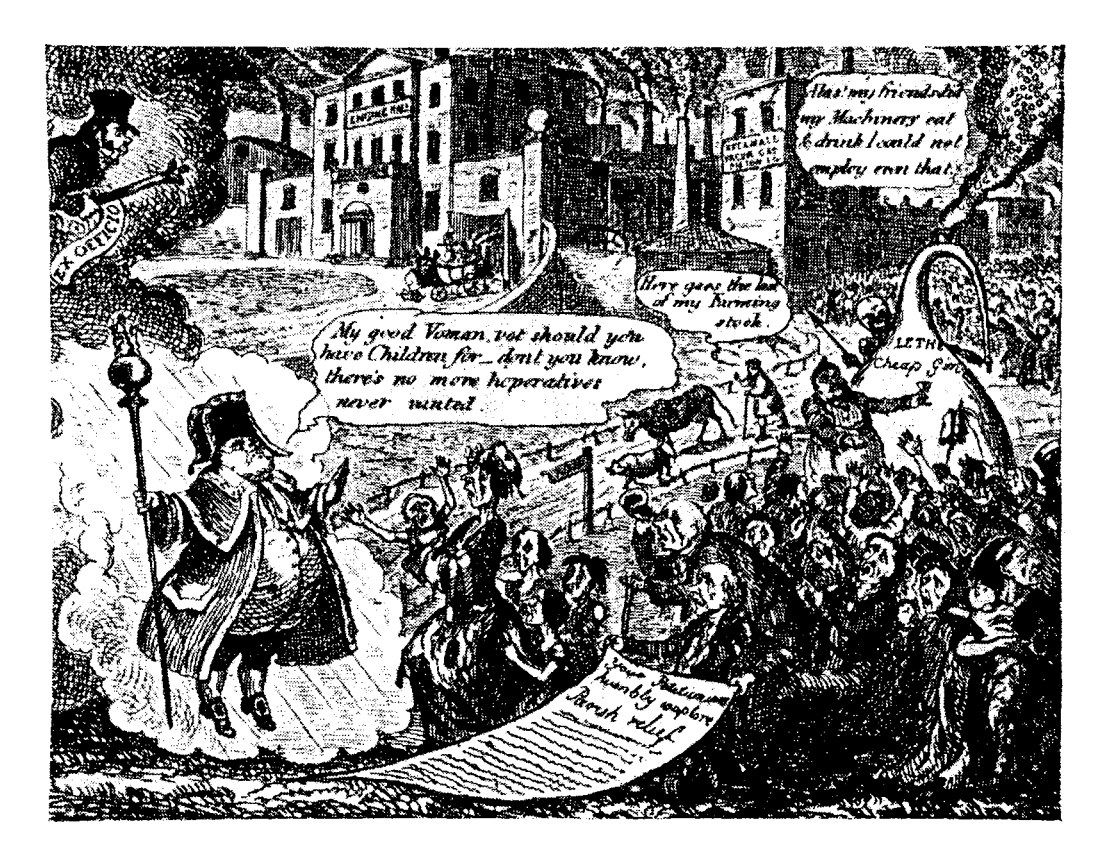
Figure 14. Robert Seymour, detail from "Heaven and Earth." Engraving, 1830.

and its successors were serially published in cheap weekly numbers, a method adopted twenty five years later by Dickens and his publishers when they launched Household Words .