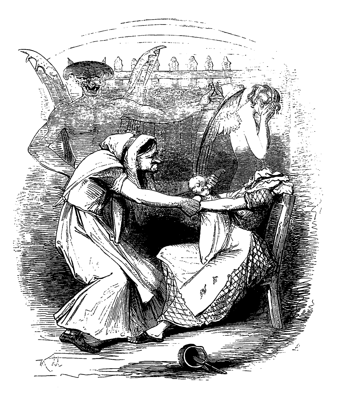
THE "MILK" OF POOR-LAW "KINDNESS."