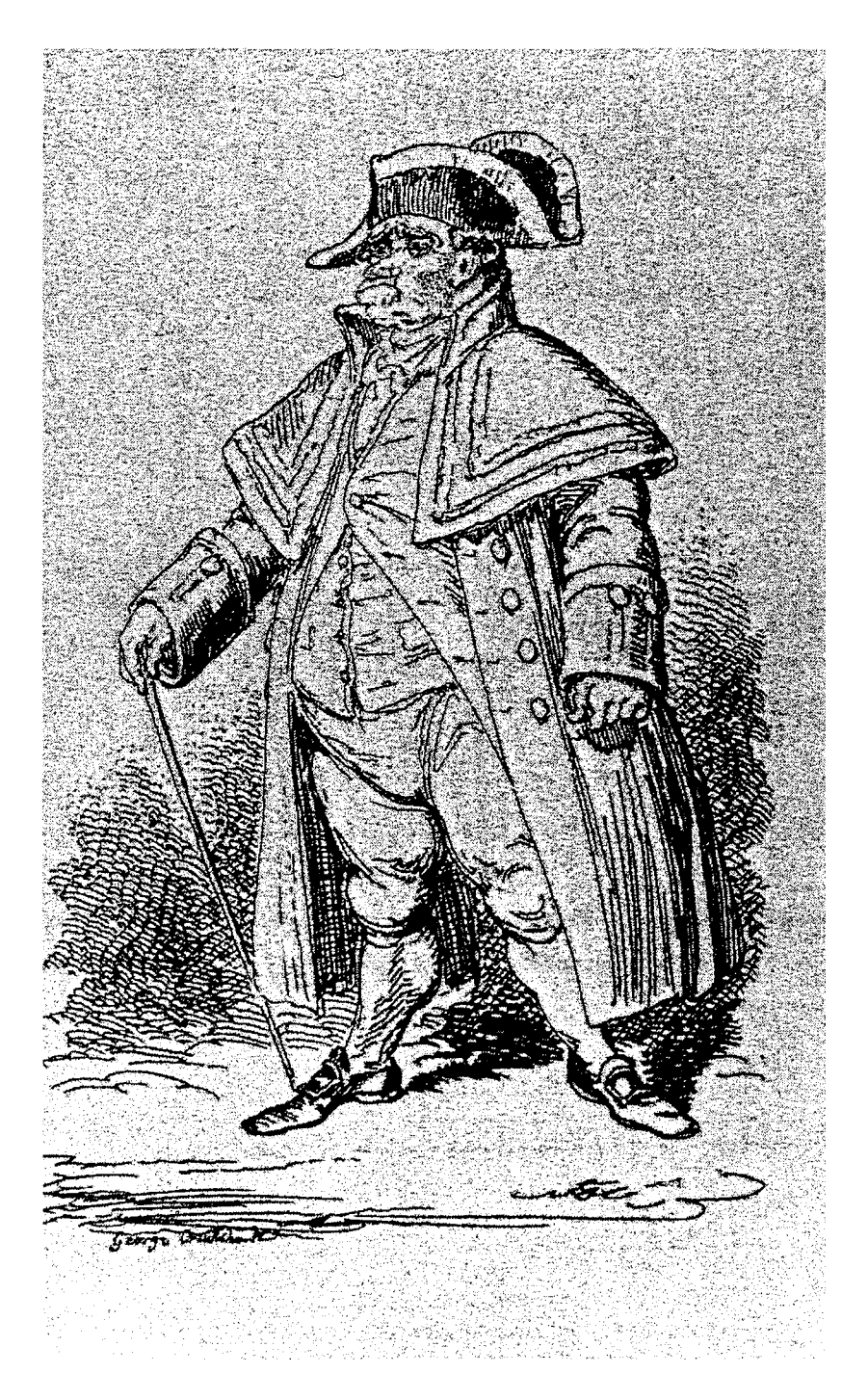
Figure 18. George Cruikshank, "Parish Beadle." Woodcut, from Gentleman's Pocket Magazine 1 (18 January 1827): 1.