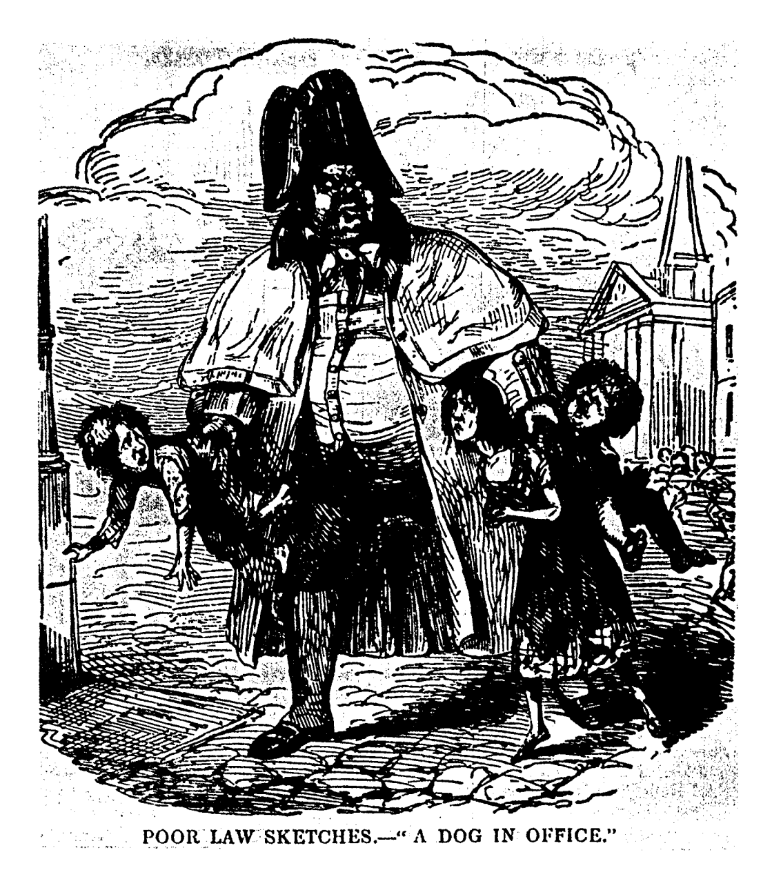
Figure 20. "Poor Law Sketches - 'A Dog in Office." Wood engraving, from Odd Fellow 1 (8 June 1839): 5.

the workhouse, with barely a glance over his shoulder at the church in the background (Figure 20). The effect of the New Poor Law on children is subjected to powerful criticism in an undated woodcut by C. J. Grant, called "Effects of the New Bastardy Law," in which the Beadle oversees the removal of cartloads of parentless infants to the workhouse (Figure 21).