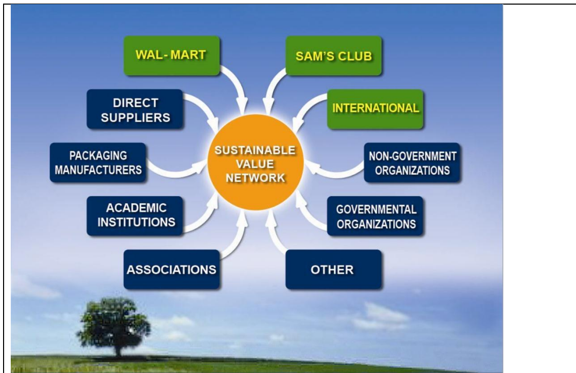
Source: Walmart Slide excerpted from presentation shown to merchants April 2007, courtesy of Walmart