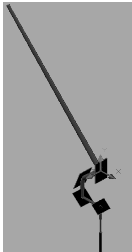
Figure 2: One example of designed transmission system in the LHD vacuum vessel.