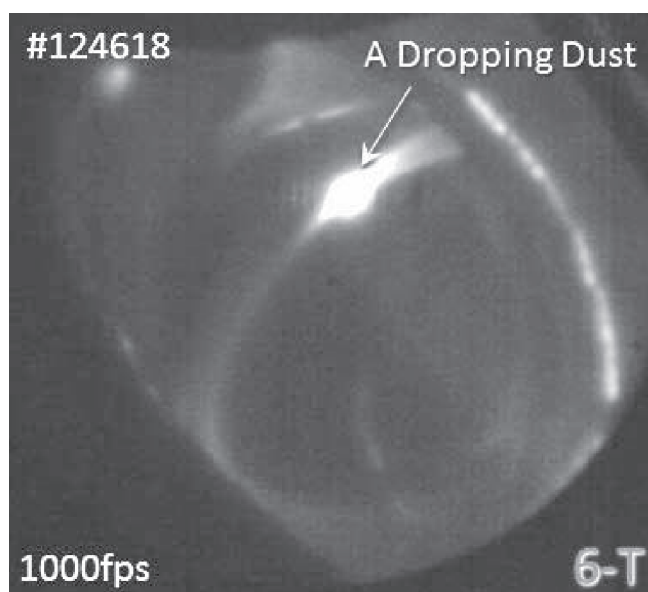
Fig. 2. Tangential image of a LHD plasma observed from a tangential port (6-T) taken with a fast framing camera at the end of a long pulse discharge in high heating power operation.