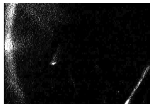
(a) without H^- beam