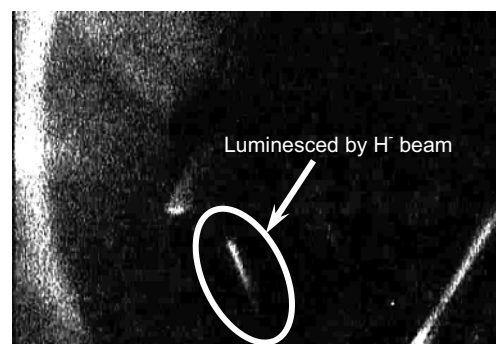
(b) with H^- beam