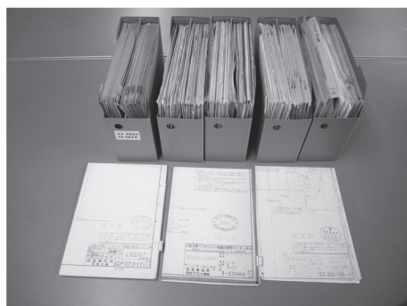
Fig. 1. An example of the collection of drawings for the Heliotron E device

This archival study aims at the comprehensive and systematic arrangement of the existing material for a series of Heliotron devices in Kyoto University, and carrying out collection, arrangement and analysis of the relating material from the technological viewpoint in device design, construction and operation control. The major activities in FY2007 are as follows.