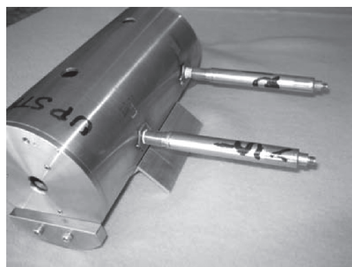
Fig. 1 Fabricated TE 011 mode Cavity at 3.5 GHz.