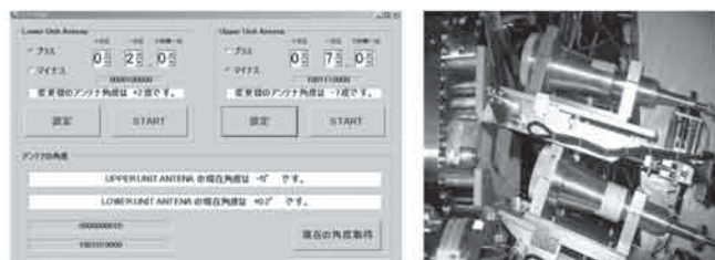
Fig. 3 Remote control system of the USRM antennas.