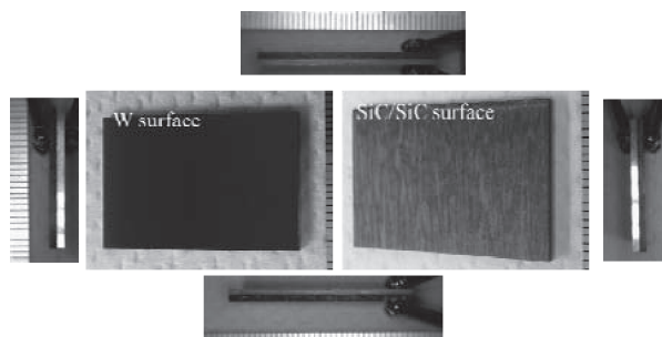
Figure 1. Test samples before Plasma Exposure

R&D and technology integration of high performance materials for plasma facing components (PFCs) and first wall are inevitable for the early realization of fusion reactor. Tungsten (W) is becoming a prime candidate as armor material for protecting high heat flux and suppressing plasma contamination. Although ITER is preparing to use W divertor, many issues are still remaining. The application of SiC/SiC composites to divertor as a substrate to W will be a potential solution to current W divertor concepts. SiC/SiC fabricated by Nano-Infiltration and Transient Eutectic phase (NITE) method has various advantages (low cost, high shape and size flexibility, etc.). In addition, small mismatch in coefficient of thermal expansion between W and SiC is a great advantage in configuring the divertor system. This report provides the high performance HHFC materials R & D status and the plasma exposure test results from LHD.