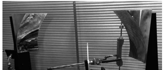
Picture 1 Experimental setup of the new interferometer system performed in our experimental room (FIT).

We have now installed these parabolic mirrors in the interferometer system, as shown in picture.1. The INRDG antenna, and the receive antenna are installed at the focal point of each reflectors.