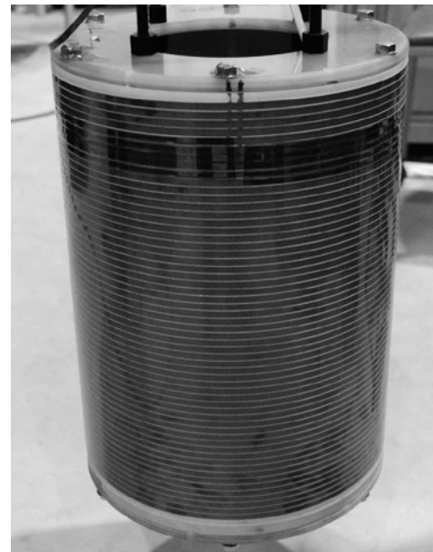
Fig. 2 Test coil wound into a 1-layer solenoidal one with a 5-filament GdBCO superconducting tape.