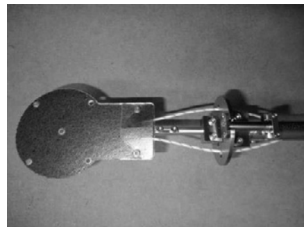
Fig. 3 A photo of the sheet heater for the end plate.