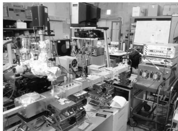
Figure 1. The devices for modulated microwave irradiation.

change and oxygen emission behavior during modulated microwave irradiation are different from these during unmodulated microwave irradiation. There is a need for further research to better understand the interaction of microwave and metal oxides.