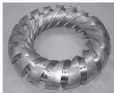
Figure 3: Winding form for the model coil.

270-kJ stored energy at the maximum magnetic field of 7.0 T using NbTi superconductors. Fig. 3 shows a photograph of the winding form made of aluminum alloy. In this demonstration, the winding of the model coil will be carried out without reinforcing materials for the NbTi superconductors, and the mechanical properties of the model coil will be investigated.