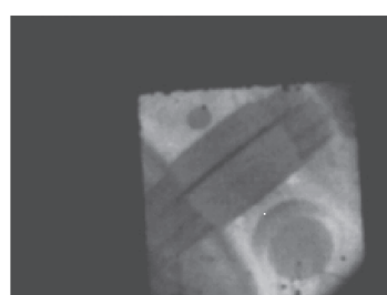
(a) H \alpha data near the center stack shown as white dot

As the CPD plasma starts this year, it is very important to get the stable plasma discharge. The fast camera is very useful to visualize the motion of CPD plasma and it is planed to measure the plasma motion intensively by the fast camera and multi-code H \alpha monitor this year.