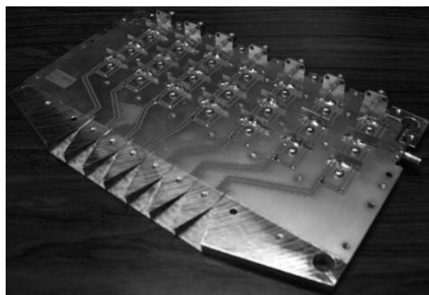
Fig.2 Lower half part of 7ch 1-D HMA.