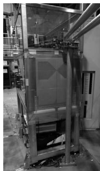
Fig. 2: The bow-tie antenna installed outside the vacuum vessel