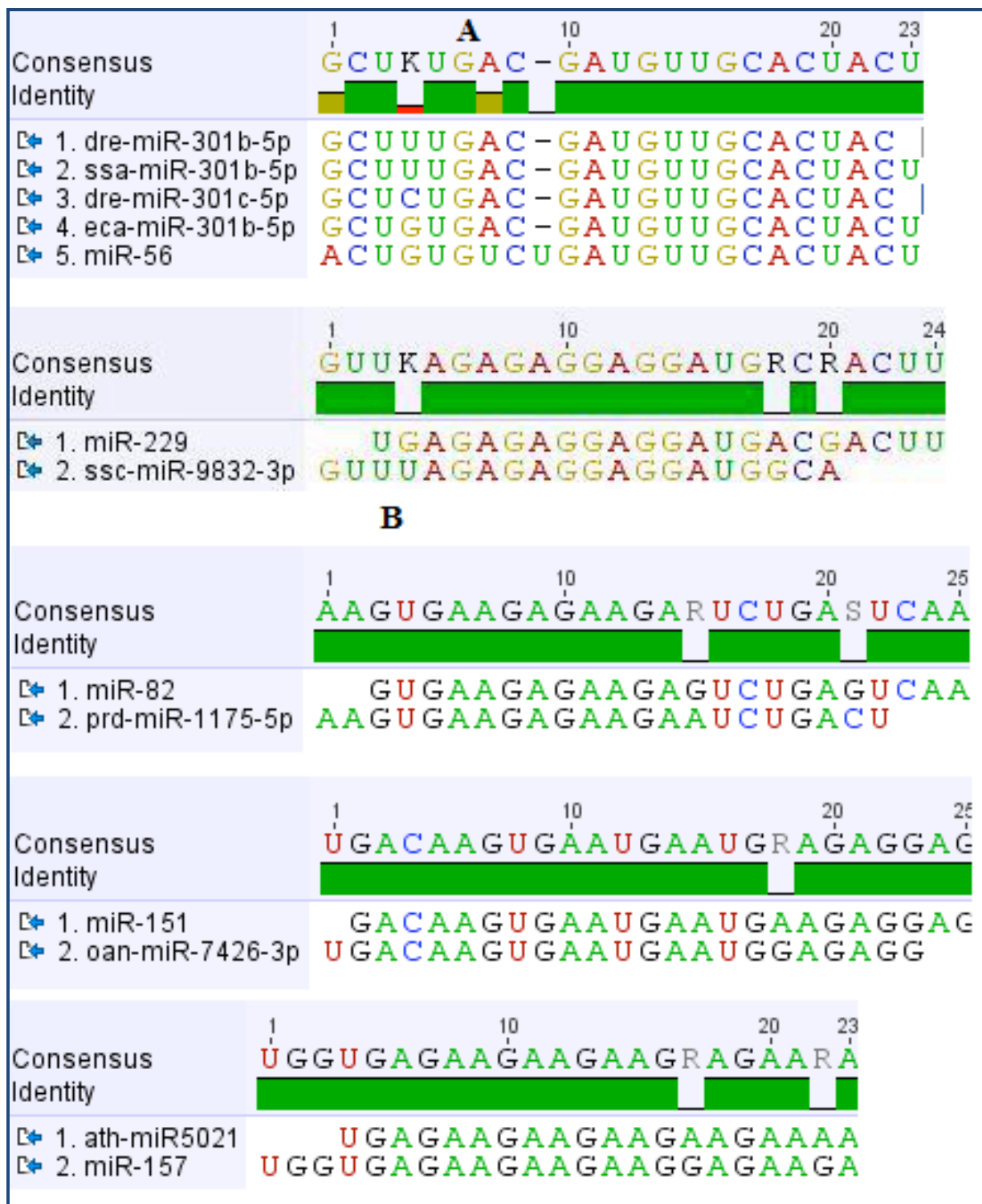
Figure 2: Sequences alignment of novel miRNA of N. fowleri and the mature miRNA from miRBase: A) sequence form 5' stem of miRNA; B) sequence form 3' stem of miRNA; prd-Panagrellus redivivus, oan-Ornithorhynchus anatinus, ath-Arabidopsis thaliana, ssc-Sus scrofa, dre- Danio rerio, ssa-Salmo salar, eca-Equus caballus.

separated by less than or equal to ( \leq ) 40 nucleotides, this would narrow the result to 12821. Since the miRNA length varies [31], we have collected the sequences of 60-120 nucleotides length which come to 8603.