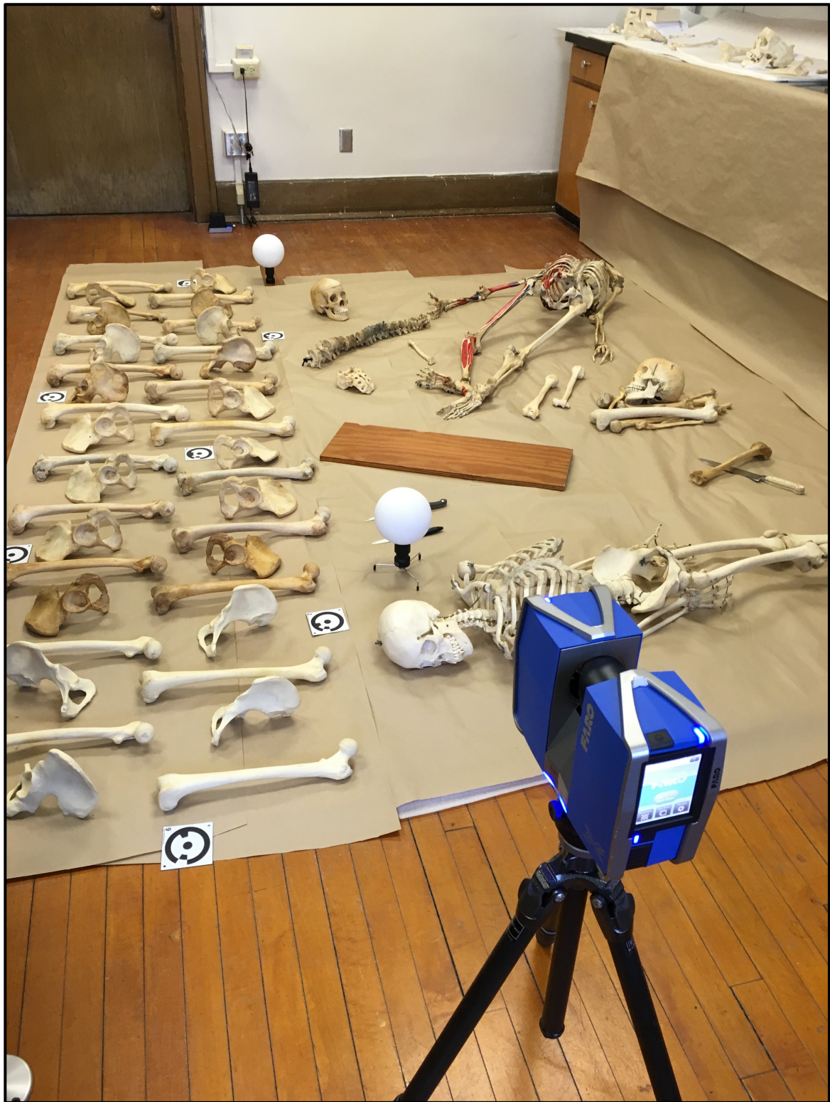
FIGURE 1 – The “hot spot” scene and the Faro Focus 3D 330X. Note the femora and hipbone series on the left side.